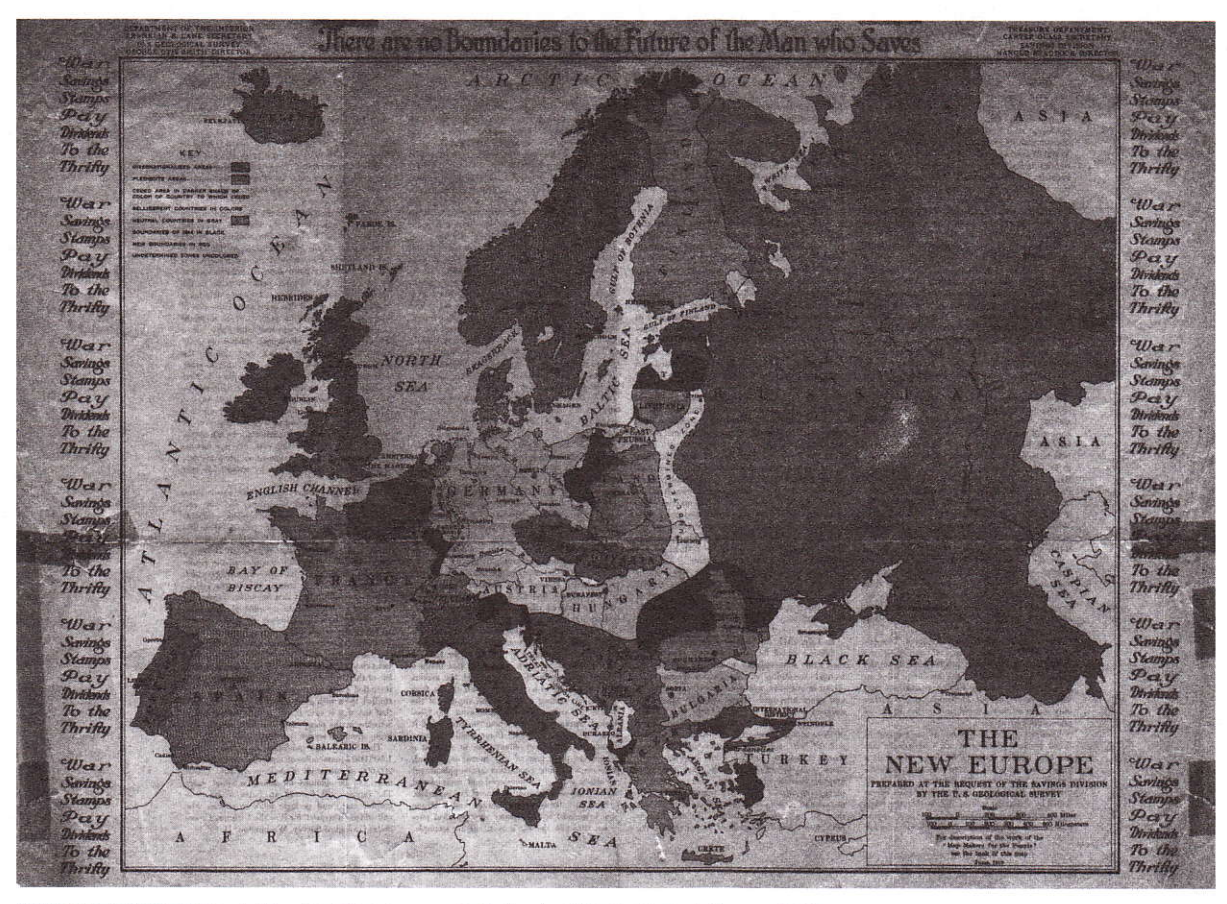
THE NEW EUROPE, published in Washington, D.C. by the U.S Geological Survey, 1919.